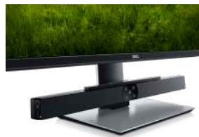
DELL PROFESSIONAL SOUND BAR - AE515M

Optimize your workspace with this efficient 23.8" monitor built with an ultrathin bezel, a small footprint and comfort-enhancing features.