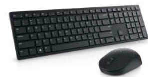
DELL PRO WIRELESS KEYBOARD AND MOUSE - KM5221W

Optimize conference calls and multimedia streaming with exceptional audio clarity. Minimize background noise while on calls with the dual mic array and echo cancellation feature.