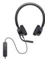
DELL PRO WIRED HEADSET - WH3022 (COMING SOON)

Wired mouse with fingerprint reader offers convenient and secure login and online access without passwords.