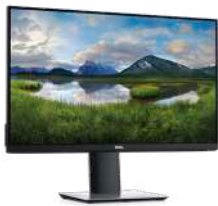
DELL 24 MONITOR - P2421D

Optimize your workspace with this efficient 23.8" monitor built with an ultrathin bezel, a small footprint and comfort-enhancing features.