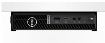
OPTIPLEX MICRO VESA MOUNT WITH ADAPTER BRACKET

Mount your system on a wall or under a surface with a VESA-compatible DVD+/-RW enclosure with full optical drive access. Includes an adapter box to securely house the system's power adapter.