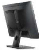
OPTIPLEX MICRO ALL-IN-ONE MOUNT FOR DELL E SERIES MONITORS

Maximize your desk space with this sleek arm that supports both system and monitor mounting.