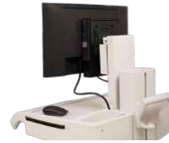
OPTIPLEX MICRO DUAL VESA MOUNT WITH ADAPTER BRACKET

This mount allows the Micro to be VESA mounted to select Dell E Series displays.