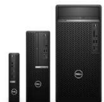
OPTIPLEX DUST FILTERS

Thermally tested custom cable covers offer an easy to install and attractive way to manage cables and secure ports.