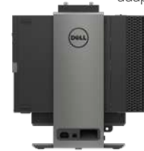
OPTIPLEX SMALL FORM FACTOR ALL-IN-ONE STAND

Small footprint mounting solution adapts to your environment, with cable management and monitor height adjustability, tilt, swivel and pivot functions.