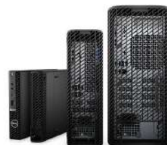
OPTIPLEX CABLE COVERS

Experience exceptional audio clarity with this Teams certified wired headset that allows you to wear the microphone on either side for a customized fit.