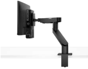
DELL SINGLE MONITOR ARM - MSA20

Maximize your desk space with this sleek arm that supports both system and monitor mounting.