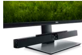
DELL PROFESSIONAL SOUND BAR | AE515M

Take your work to new heights with this 23.8-inch FHD monitor with a wide color coverage. Features ComfortView Plus an always-on built-in low blue light screen, fast connectivity and transfer speeds.