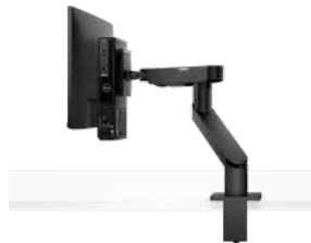
DELL SINGLE MONITOR ARM | MSA20

Mount your system on a wall or under a desk. Includes an adapter box to securely house the system's power adapter.