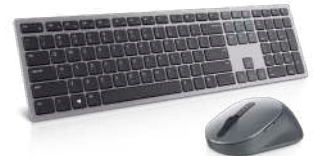
DELL PREMIER MULTI-DEVICE WIRELESS KEYBOARD AND MOUSE | KM7321W

Optimize conference calls and multimedia streaming with exceptional audio clarity. Minimize background noise while on calls with the dual mic array and echo cancellation feature.