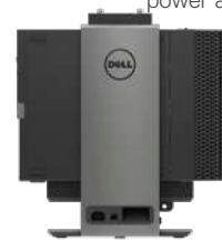
OPTIPLEX SMALL FORM FACTOR ALL-IN-ONE STAND

Minimize your footprint with this arm that offers easy installation and enhanced adjustability while keeping cables neatly hidden from view.