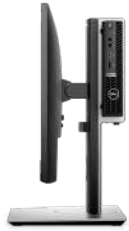
OPTIPLEX MICRO ALL-IN-ONE STAND

Small footprint mounting solution adapts to your environment, with cable management and monitor height adjustability, tilt, swivel and pivot functions.