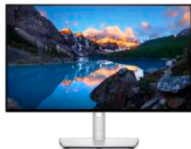
DELL ULTRASHARP 24 MONITOR | U2422H

See more and do more with a 27" QHD monitor that expands your workspace and gives you a better view of all your important tasks.