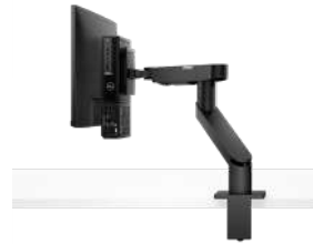
OPTIPLEX MICRO DUAL VESA MOUNT WITH ADAPTER BRACKET

This mount allows the Micro to be VESA mounted to select Dell E Series displays.