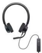
DELL PRO WIRED HEADSET | WH3022

Wired mouse with fingerprint reader offers convenient and secure login and online access without passwords.