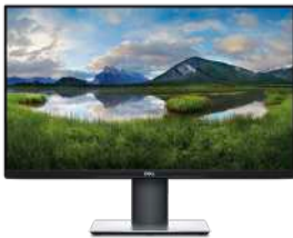
DELL 27 MONITOR | P2720D

See more and do more with a 27" QHD monitor that expands your workspace and gives you a better view of all your important tasks.