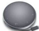
Dell Mobile Adapter Speakerphone - MH3021P

Collaborate with ease anywhere with this Teams certified wireless headset which offers active noise cancellation and smart sensors that automatically mute and unmute your call.