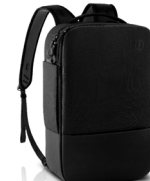
Dell Pro Hybrid Briefcase Backpack 15 - PO1521HB

Multiport adapter with integrated speakerphone offers an all-in-one connectivity and conferencing solution.