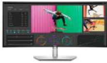
Dell UltraSharp 34 Curved USB-C Hub Monitor - U3421WE

Get immersive productivity on a 34" WQHD curved monitor with a wide color coverage and extensive connectivity including RJ45, USB-C and quick-access front ports.